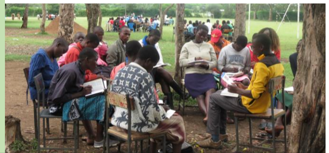
Small group bible studies during youth conference.